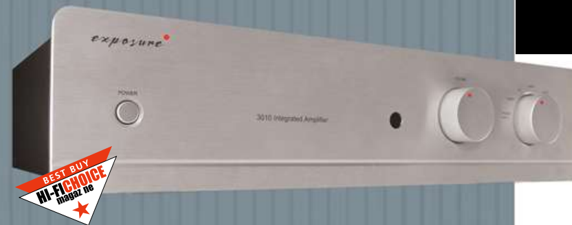
3010 Integrated Amplifier

“ The bass is almost juicy with the right disc - quite an accolade for a CD player ”