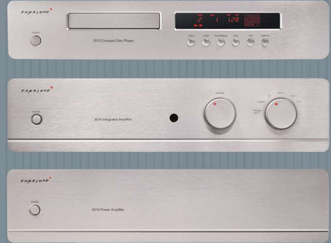
Exposure 3010 series

Simply because, as engineers of award-winning hi-fi equipment for over 30 years, Exposure believes that it's high time great-sounding music was made available to everyone.