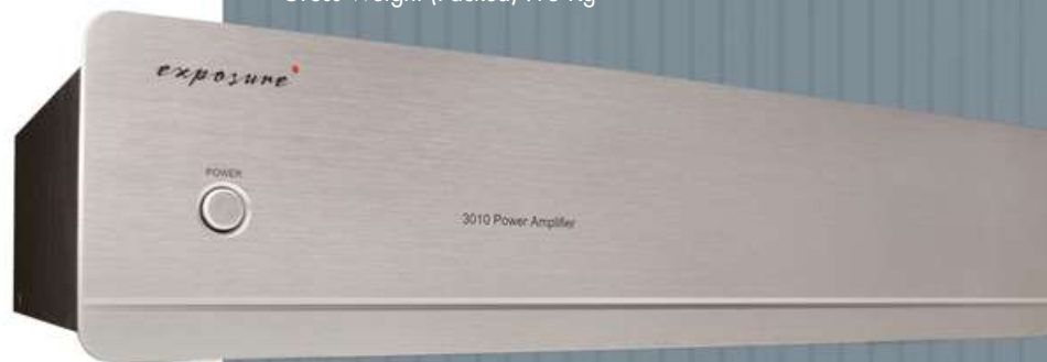
3010 Power Amplifier

Power Output, Stereo Mode : 100 Watts per channel at 1KHz into 8 Ohms Power Output, Mono Mode : 110 Watts at 1KHz into 8 ohms Input Impedance : 18Kohm Input Sensitivity : 1.75V, gain +24dB. Frequency Response : 20Hz - 20 KHz \pm 0.5dB Total Harmonic Distortion : <0.015% at rated output, ref 1 KHz Signal to noise : >110 dB A weighted, ref rated output Channel Separation : >70dB, 20Hz - 20KHz Mains Supply : 110/120V or 220/240V, 50/60Hz (factory set) Power Consumption : <350VA, 8 ohm load both channels driven Dimensions (H x W x D) : 115 mm x 440 mm x 300 mm Nett Weight (unpacked) : 11 Kg Gross Weight (Packed) : 13 Kg